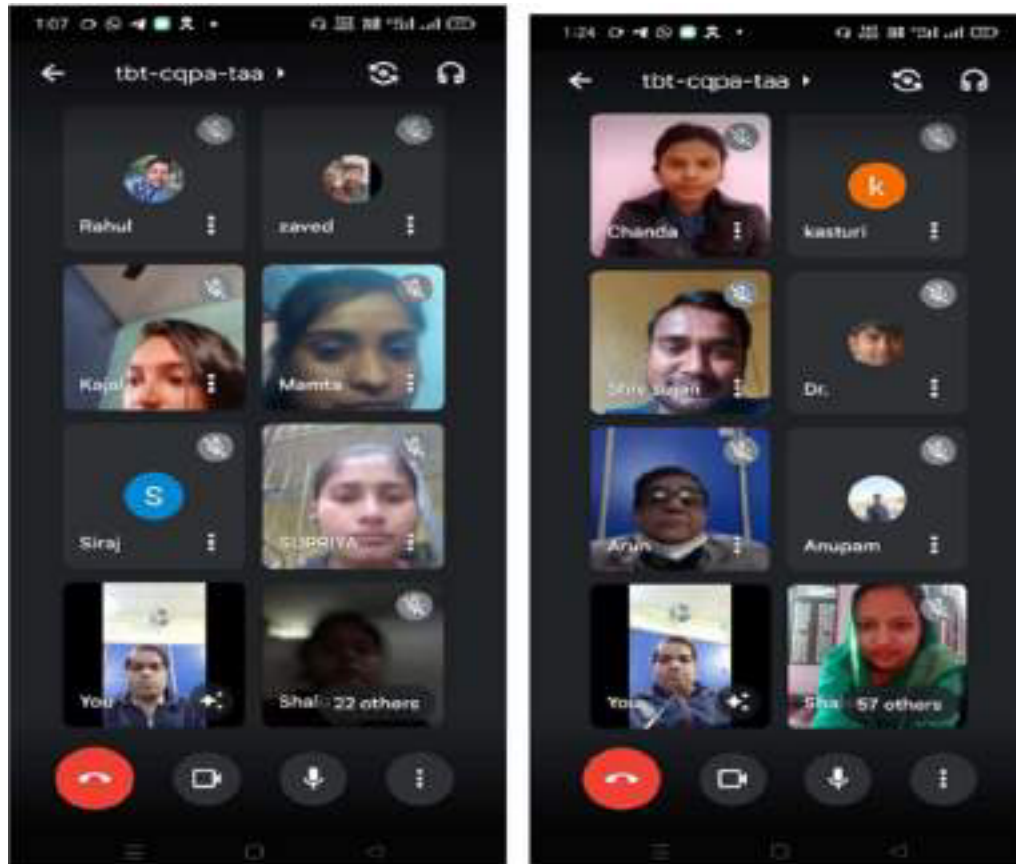
Webinar on International Women's Day