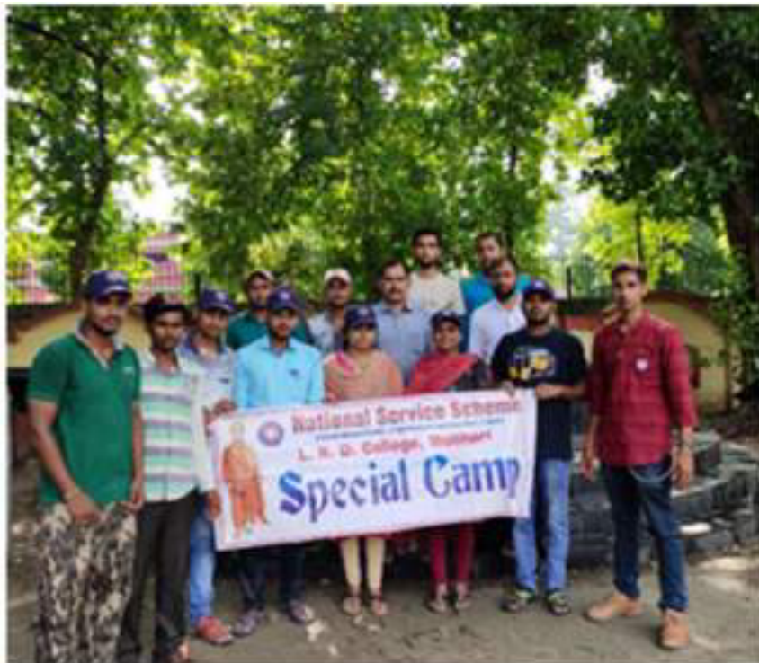
Community awareness drive in localities