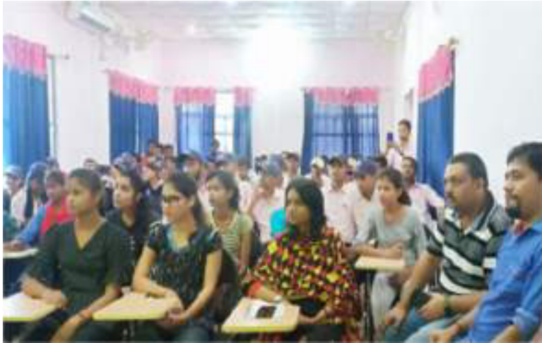
Gender Awareness Programme