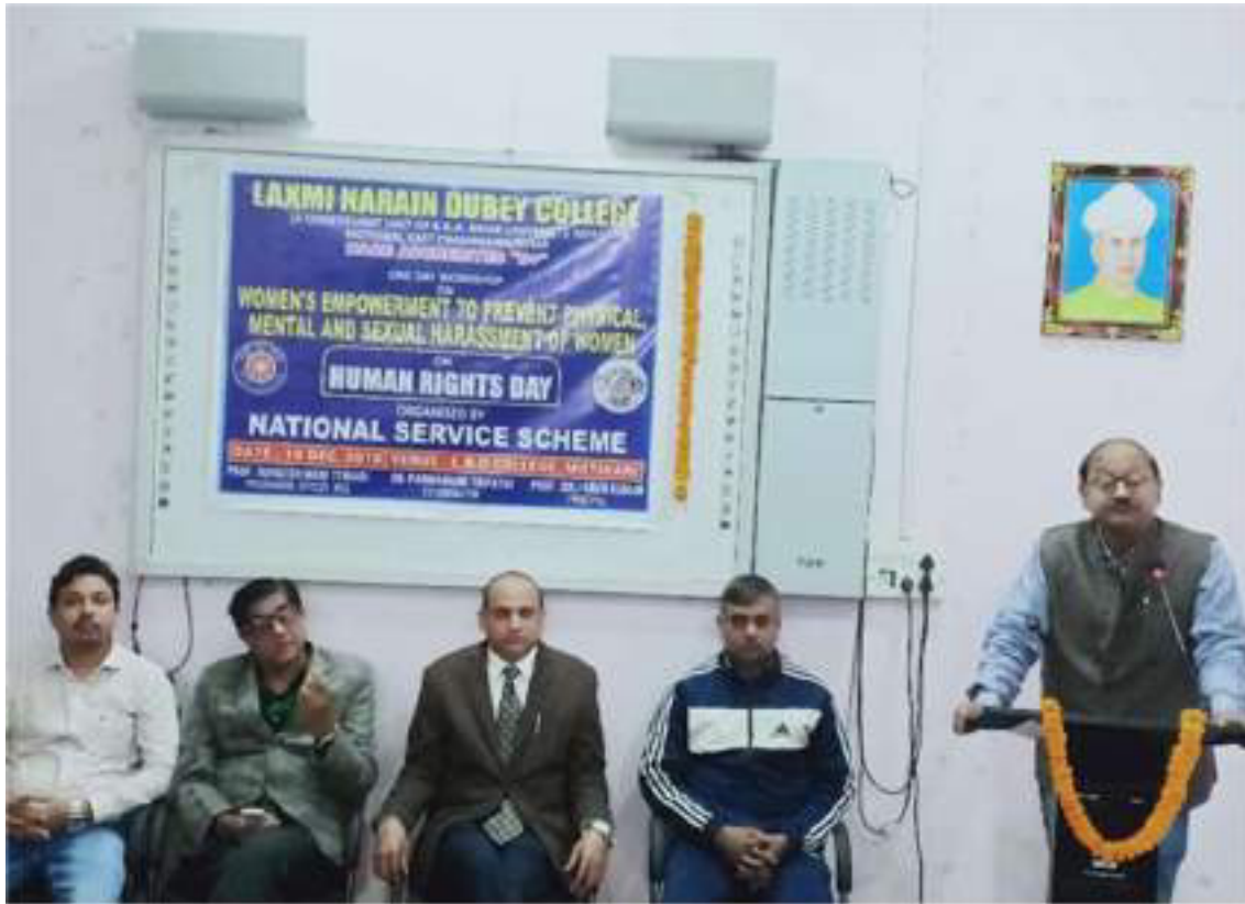
National level seminar on “Women Empowerment to prevent Physical, Mental and Sexual Harassment of women”