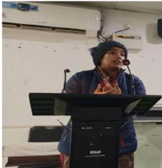
Workshop on Good touch & Bad Touch