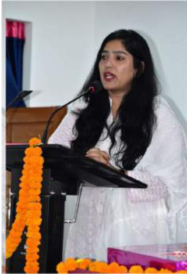
Coordinator addressing student participants of Gender Equality Special Camp