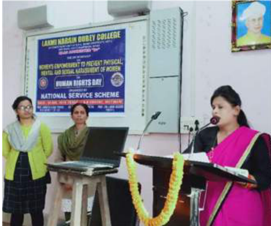
National level seminar